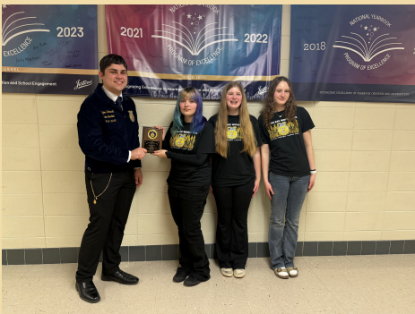
Green Bay Middle School A