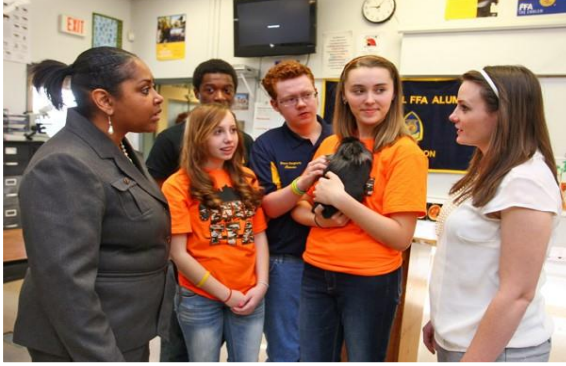
Growing Leaders, Building Communities, Strengthening Agriculture

"We make a living by what we get; we make a life by what we give."