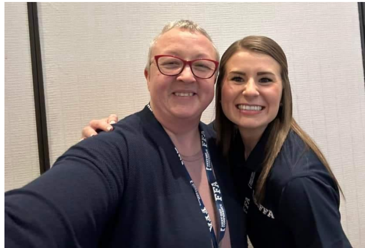
Wisconsin was well represented at the National FFA NextGen Ag Communications Conference - Fort Worth, Texas