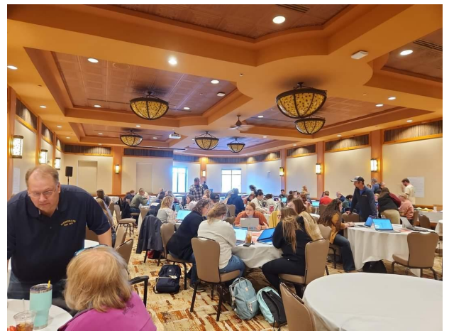
2024 proficiency judges busy evaluating applications in Wisconsin Dells